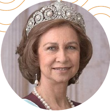
Reina Doña Sofia Spanish Royal Family

You may read the official letter and statement below.